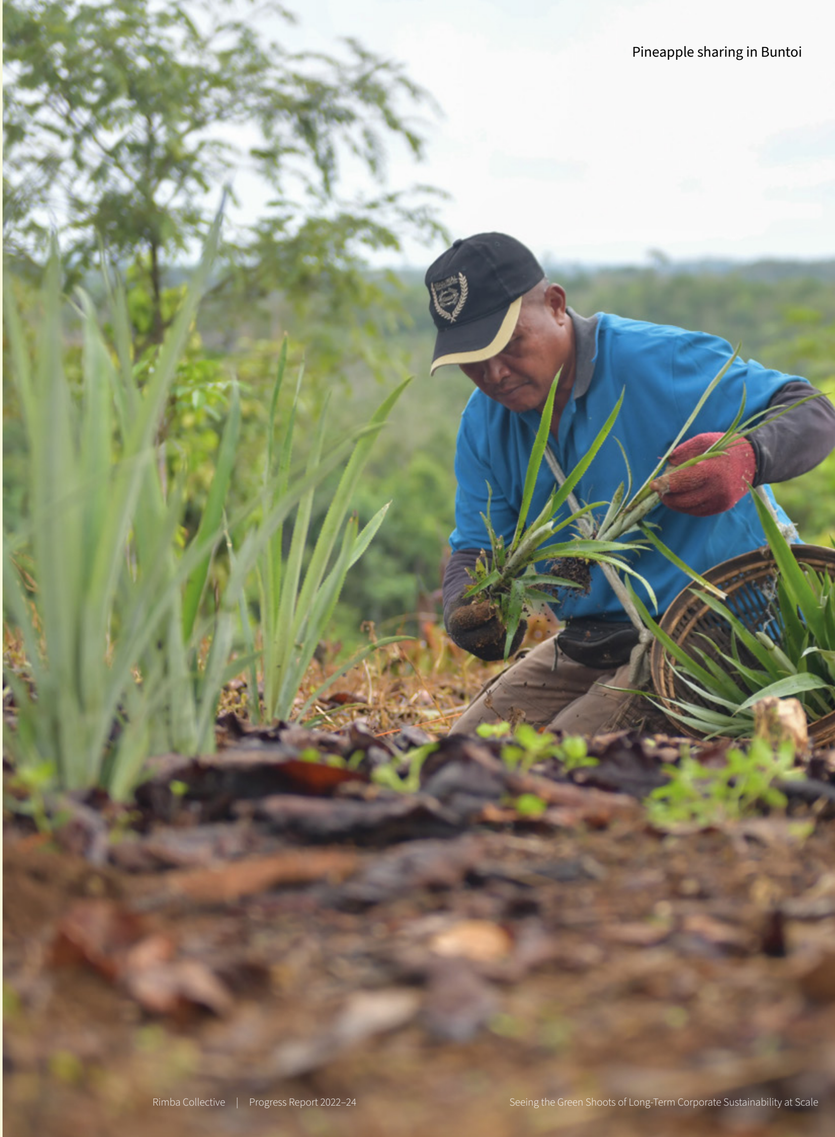
Pineapple sharing in Buntoi

Rimba Collective projects create more forest-friendly livelihoods by working with partners to strengthen sustainable local economies. We help create jobs that protect forests, draw on their natural resources, and present opportunities to reach wider markets. By building stronger local economies, we also support local people’s land rights and improve access to local services, including healthcare, education, clean water and sanitation.