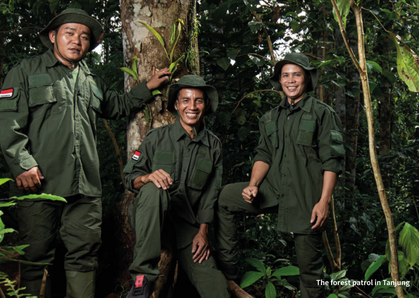
The forest patrol in Tanjung

The patrol was also poorly equipped. With little training, the team set out without ‘handy talkies’ (walkie-talkies), limiting the area they could monitor. They also had just a single GPS device and camera and no recharging equipment or software to compile reports. It was a frustrating situation that is all too common in Indonesia: local people passionate about protecting their forest but thwarted by a lack of resources.