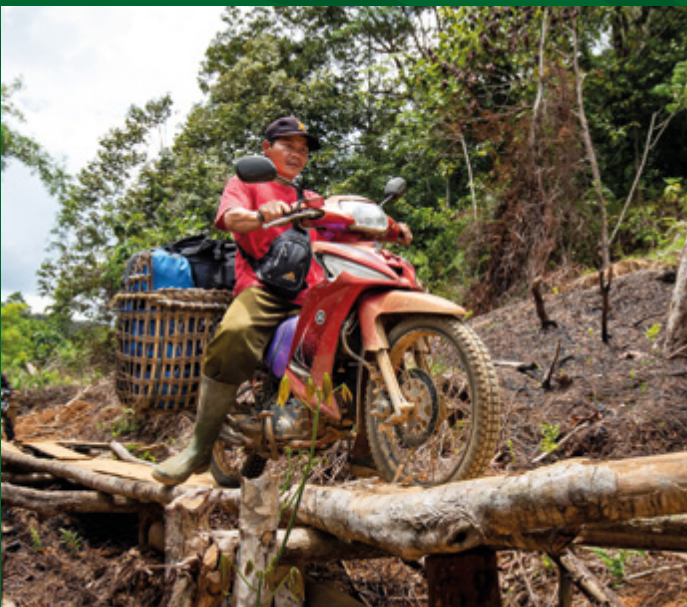
Navigating treacherous terrain by motorcycle to reach Bahenap Village.