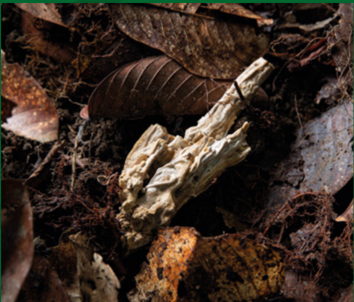
A close-up look at the damar resin found in Tanjung Village, West Kalimantan.