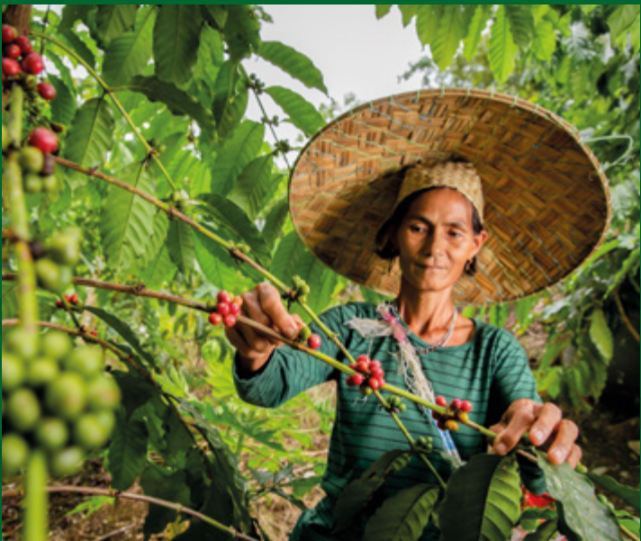
A Dayak farmer harvests coffee.

~12,620 forest-dependent households to benefit