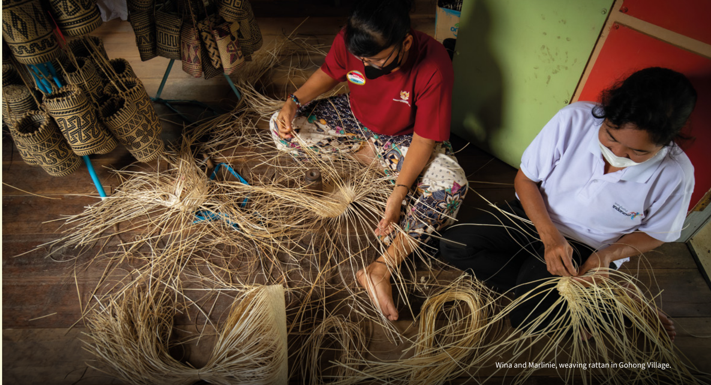
Wina and Marlinie, weaving rattan in Gohong Village.

Rattan is a versatile material grown in peatland ecosystems, which makes it a ‘paludiculture crop’. In Gohong, it used to be used to make floor mats. Now, six local rattan businesses manufacture everything from bags and bracelets to hats and shoes. A rattan bracelet sells for 25,000 rupiah (USD 1.7), while a large floormat could be 1 million rupiah (USD 70.5). The complex patterns they weave hail from the Dayak, a native group of Kalimantan.