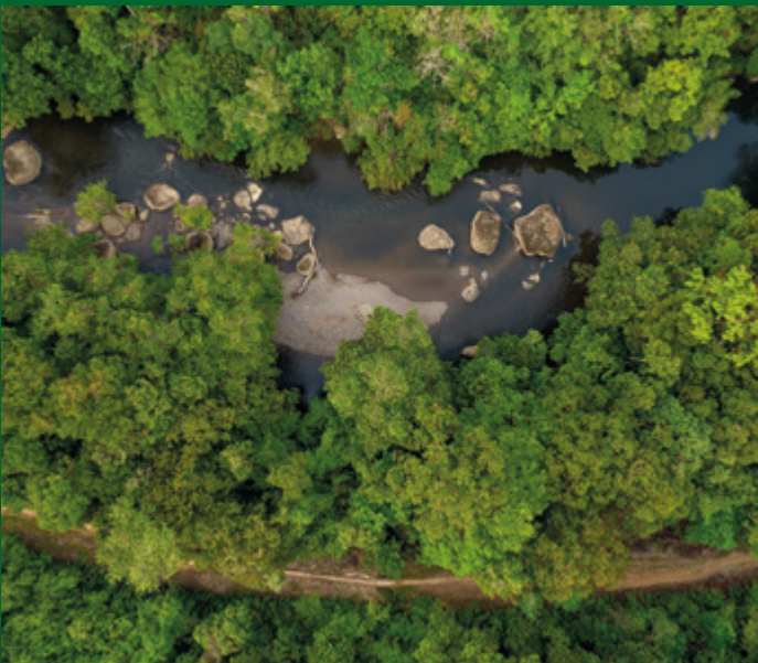
Capturing the Bahenap River from above.